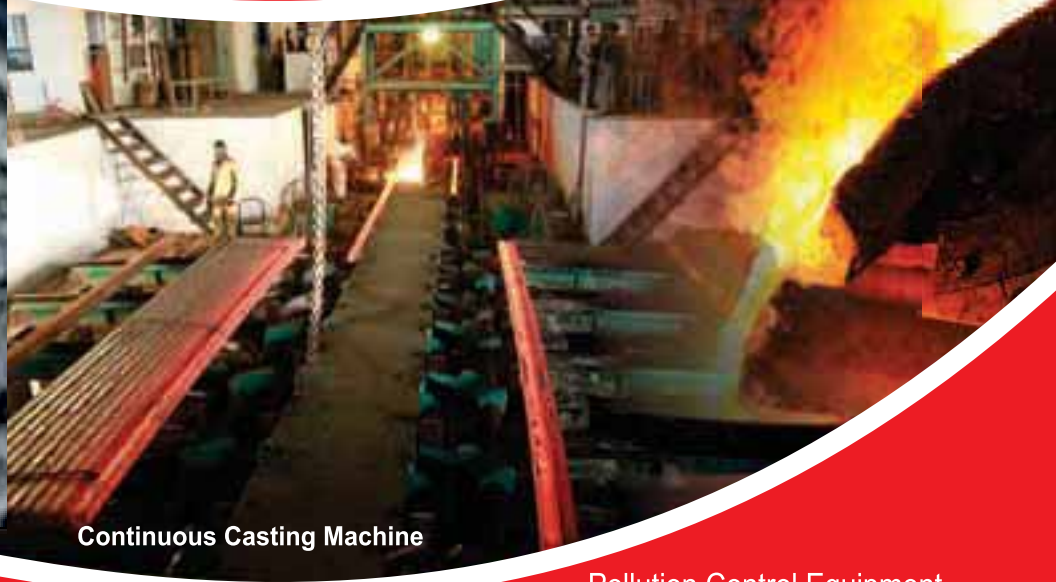
Continuous Casting Machine

Melting equipments for Steel Plants & Foundries