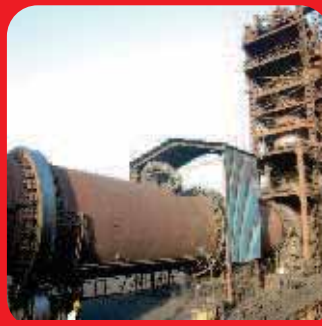
Coal Based DRI Plant