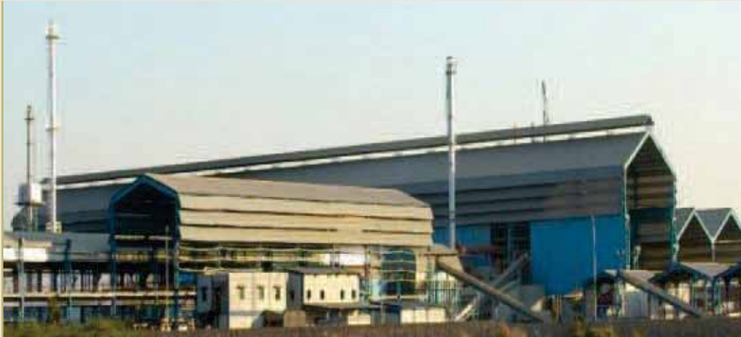
Plant at Samakhiali, Kutch