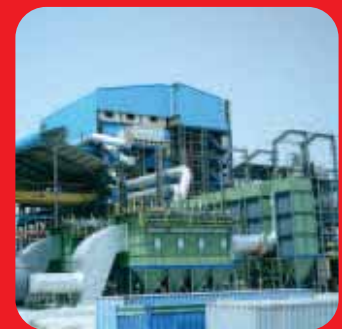
Pollution Control Equipment