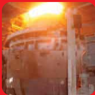
Metal Refining Konverter