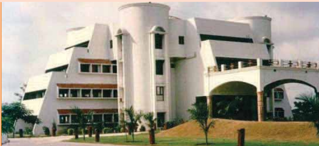
Corporate House at Palodia