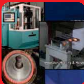
Induction Heating Equipment