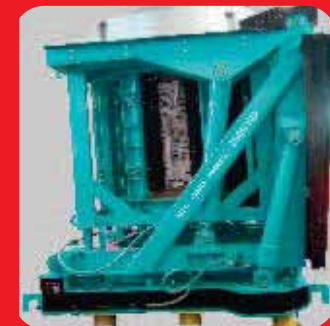
Melting equipments for Steel Plants & Foundries